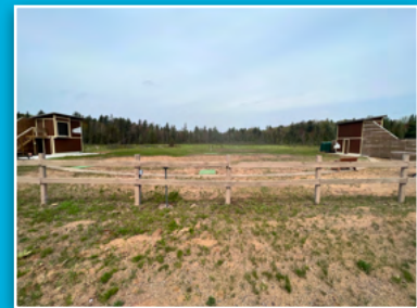
Top: Clubhouse bar and dining room